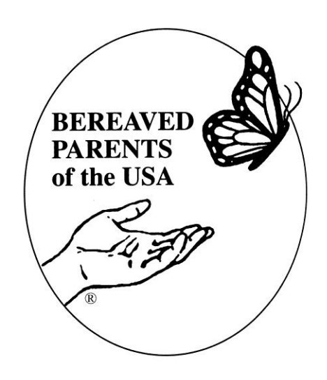
June - July 2010

Bereaved Parents of the USA Hinsdale Chapter P.O. Box 703 Hinsdale, IL 60522-0703